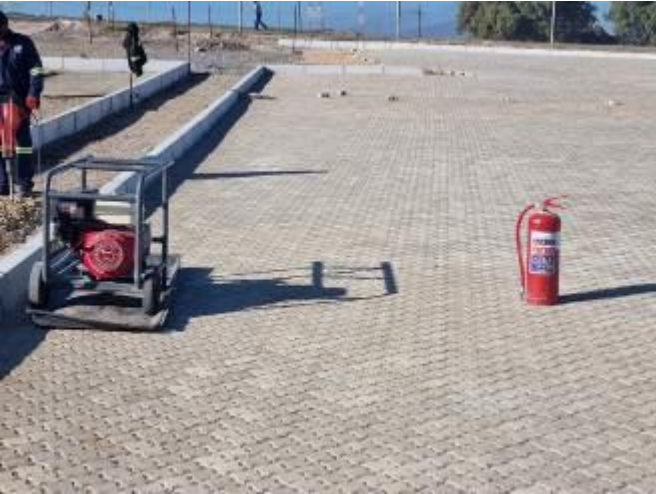
Image 8: Generator with accompanying drip tray and fire extinguisher.